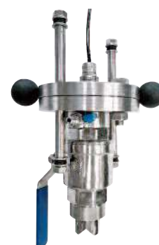
S305-INS probeholder for insertion into the pipe